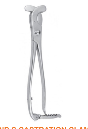
SAND S CASTRATION CLAMP TC-91-1164 EMESCULATOR