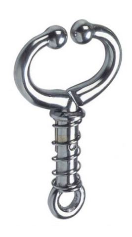
SPRING NOSE LEADER TC-91-1146 BULL HOLDER