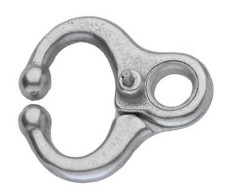
NOSE LEADER TC-91-1144 BULL HOLDER