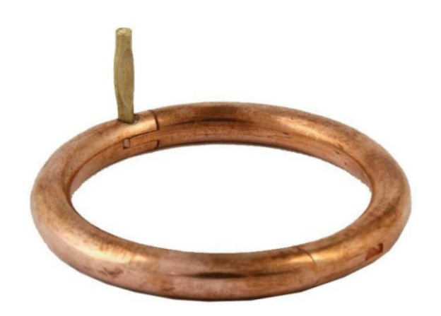
COPPER BULL RING 2.25", 2.15, 3 TC-91-1158 COPPER BULL RING 2.25", 2.75", 3"