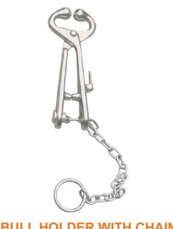
BULL HOLDER WITH CHAIN TC-91-1149 BULL HOLDER