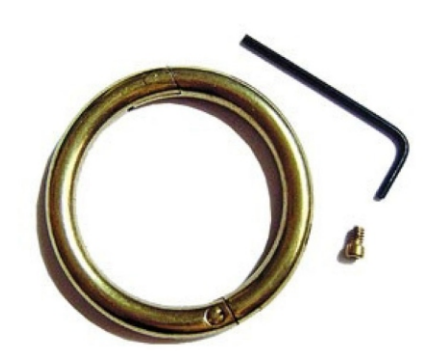
BULL RING - BRASS - SMALL 2 1/2" X 5/16 TC-91-1152 BULL RING - BRASS - SMALL 2 1/2" X 5/16"