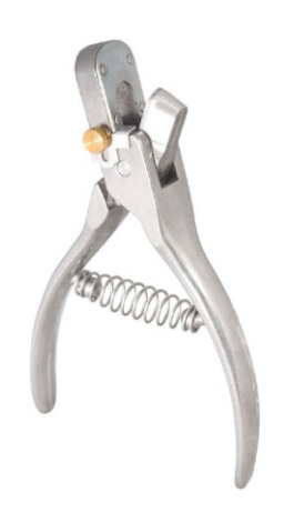
EAR NOTCHER - U NOTCH LARGE EAR NOTCHER - U NOTCH LARGE TC-91-1162 EAR NOTCHER - U NOTCH LARGE