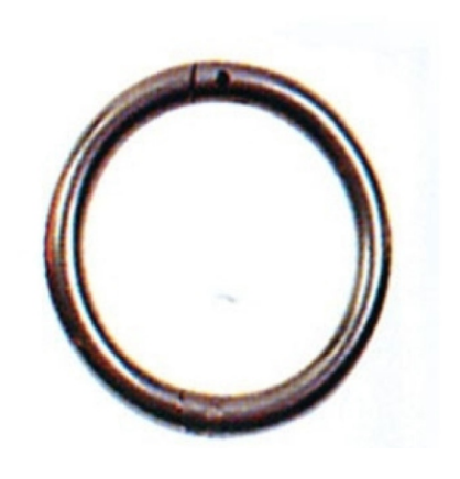
BULL RING - STAINLESS - 2 1/2" TC-91-1155 BULL RING - STAINLESS - 2 1/2