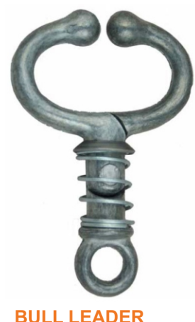
BULL LEADER TC-91-1145 BULL HOLDER