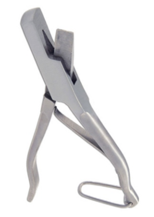
EAR NOTCHER V LARGE TC-91-1160 EAR NOTCHER