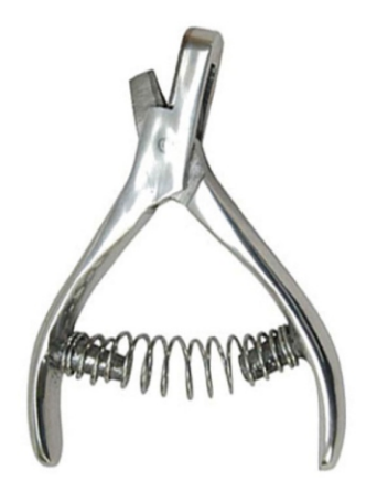
EAR NOTCHER, SMALL 'V', (5/16" AT BASE) TC-91-1159 EAR NOTCHER