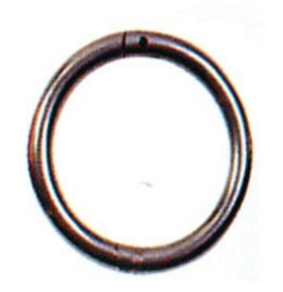
BULL RING - STAINLESS - 3" TC-91-1157 BULL RING - STAINLESS - 3"