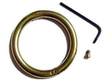
BULL RING - BRASS -DIARY 3' X 5/16 TC-91-1154 BULL RING - BRASS -DIARY 3' X 5/16