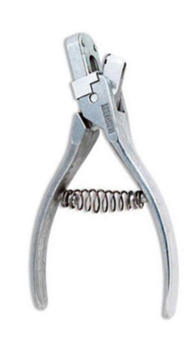
TC-91-1163 EAR NOTCHER - U NOTCHER LARGE