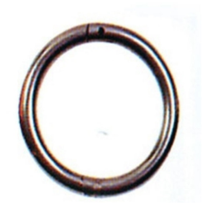
BULL RING - STAINLESS - 2 1/2 TC-91-1156 BULL RING - STAINLESS - 2 1/2