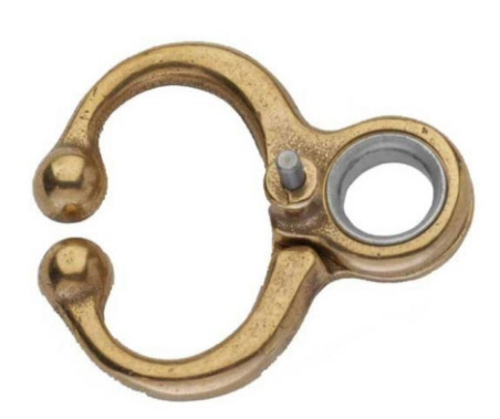
BRASS NOSE LEADER TC-91-1143 BULL HOLDER