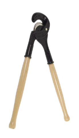
CONVEX JUNIOR DEHORNER TC-91-1136 BERNES DEHORNER